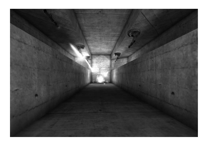
Figure 2: Screenshot from Turret Hallway Mini-Game

In the current version of the testbed, we have implemented a variety of mini-game gameplay scenarios using UnrealScript and UnrealEd (Busby et al. 2005). These include two jumping mini-games (one with fatal consequences, the other with no failure consequences), a timed maze navigation mini-game, a turret mini-game requiring the player to navigate a short hallway lined with automated, indestructible gun turrets, and a fighting minigame requiring the player to make their way through a room full of heavily armed enemy non-player characters. A screenshot from one of these scenarios is given below in Figure 2. Recognizing the limitations of experimenting with mini-games, as discussed in the next section, we are also building the Neomancer project (Katchabaw 2005) based on our new game type, to provide a complete experience action/adventure/role-playing game for experimentation and development activities.