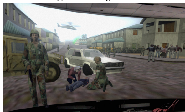
Figure 1: The Mission Rehearsal Exercise System, showing, from the left, the platoon sergeant, the injured boy and his mother, a medic, and a crowd.